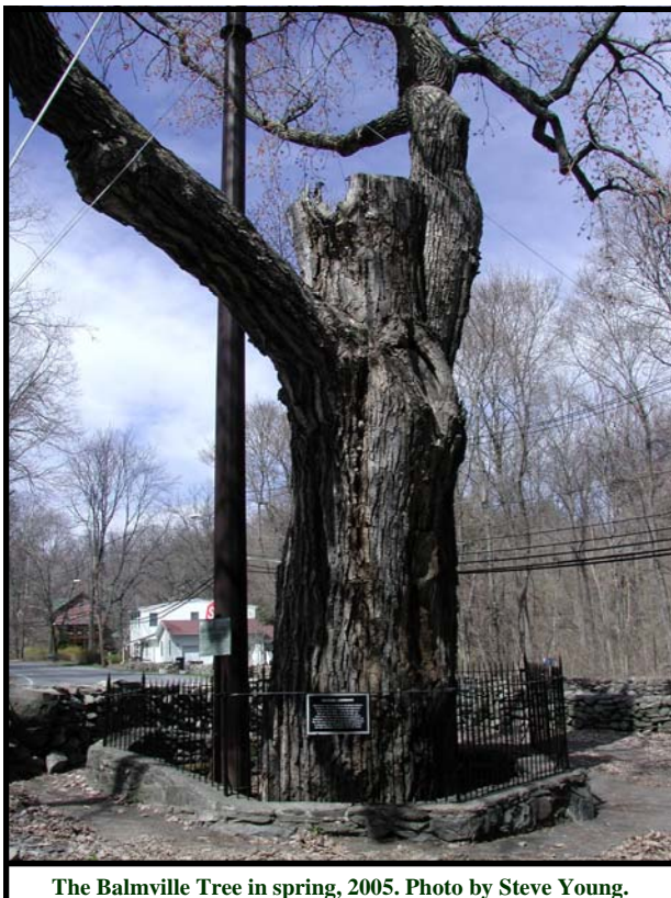
The Balmville Tree in spring, 2005.

Conservation Law: Balmville Tree (eastern cottonwood x carolina poplar) located at the intersection of River Road, Balmville Road and Grand Avenue in the unincorporated community of Balmville, Town of Newburgh, Orange County.”