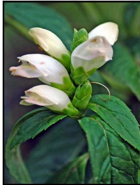
Turtlehead ( Chelone glabra ).