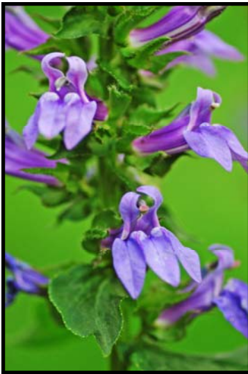
Blue Lobelia ( Lobelia siphilitica ).