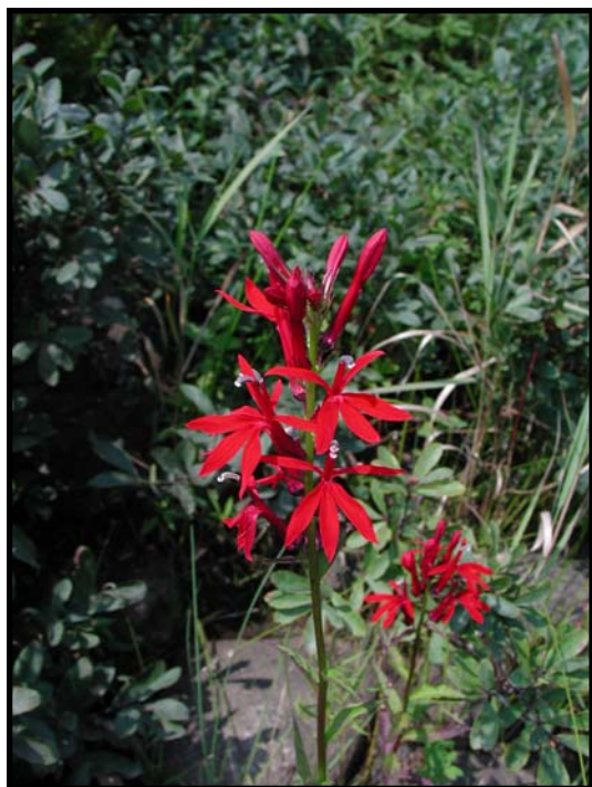
Cardinal Flower ( Lobelia cardinalis).