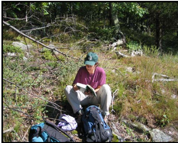
An intrepid field biologist using Gleason and Cronquist.