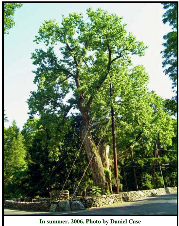
In summer, 2006.