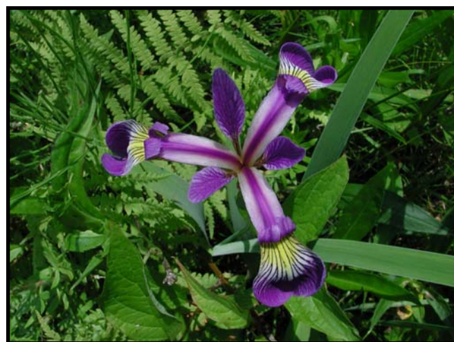
Blue Flag Iris ( Iris versicolor ).