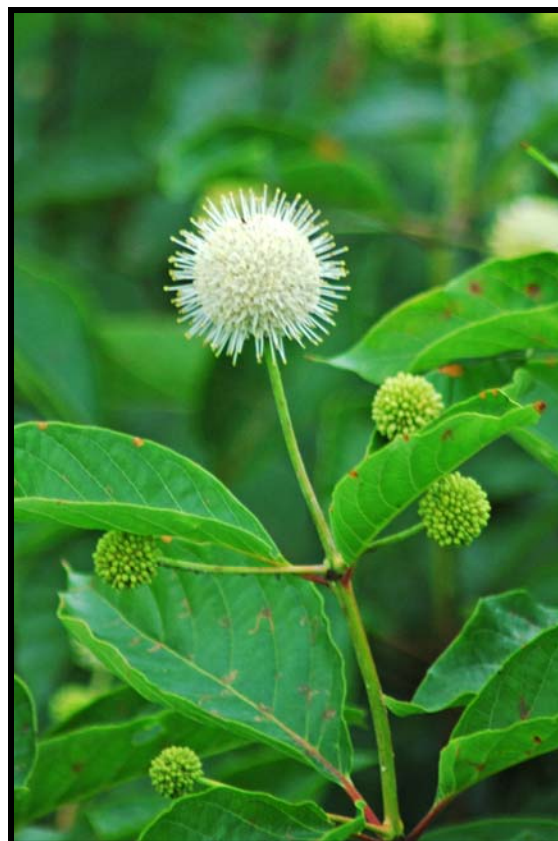
Buttonbush ( Cephalanthus occidentalis ).