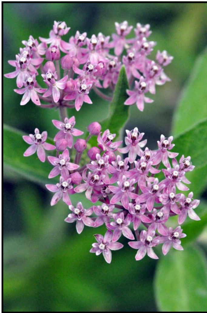
Swamp Milkweed ( Asclepias incarnata ).

You should consider whether your site is sunny or shady when selecting plants. Remember – you need